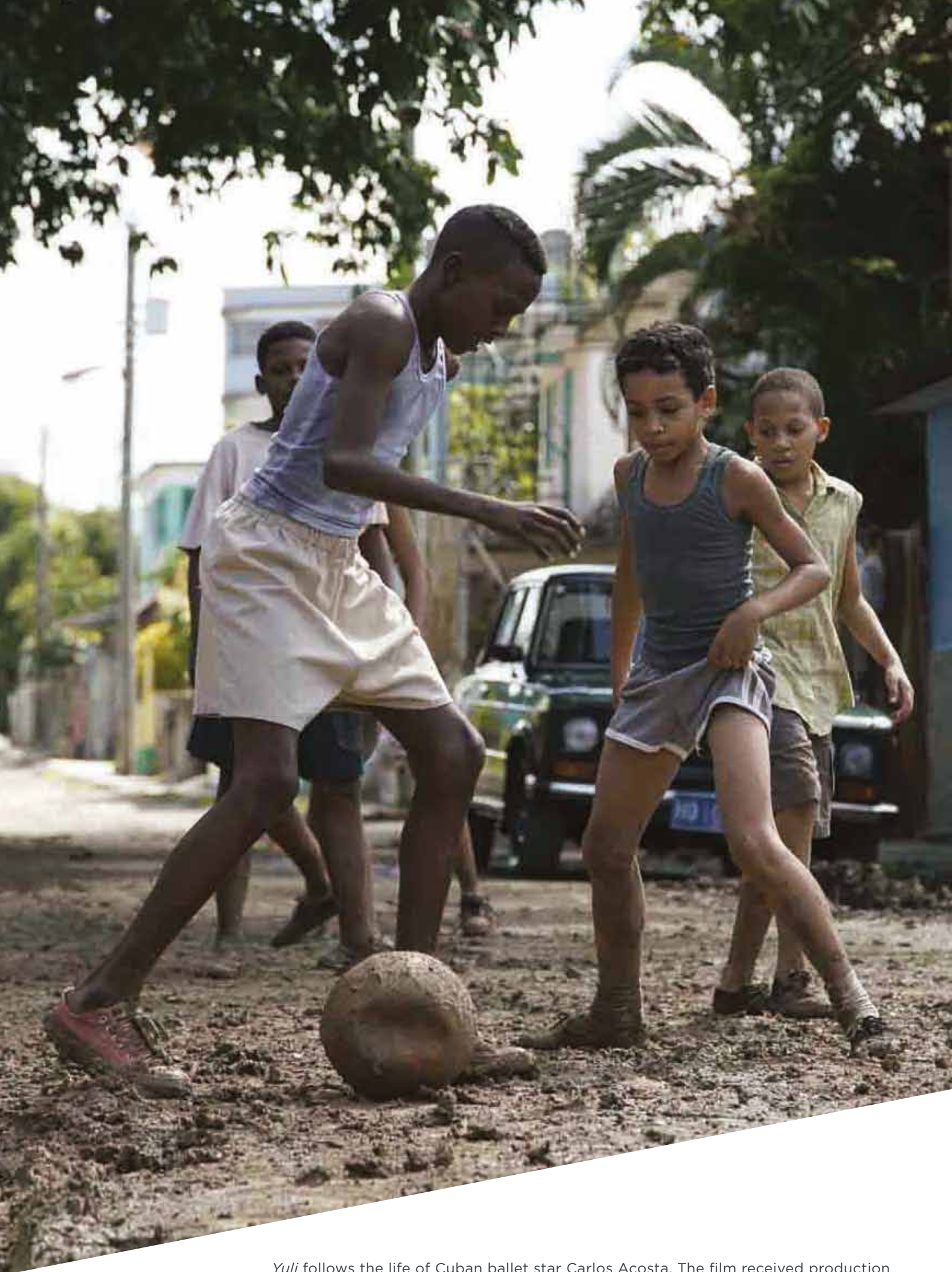
Yuli follows the life of Cuban ballet star Carlos Acosta. The film received production funding from Screen Scotland to support Scotland-based Director, Icíar Bollain and Paul Laverty ( I Daniel Blake , The Angels' Share ).