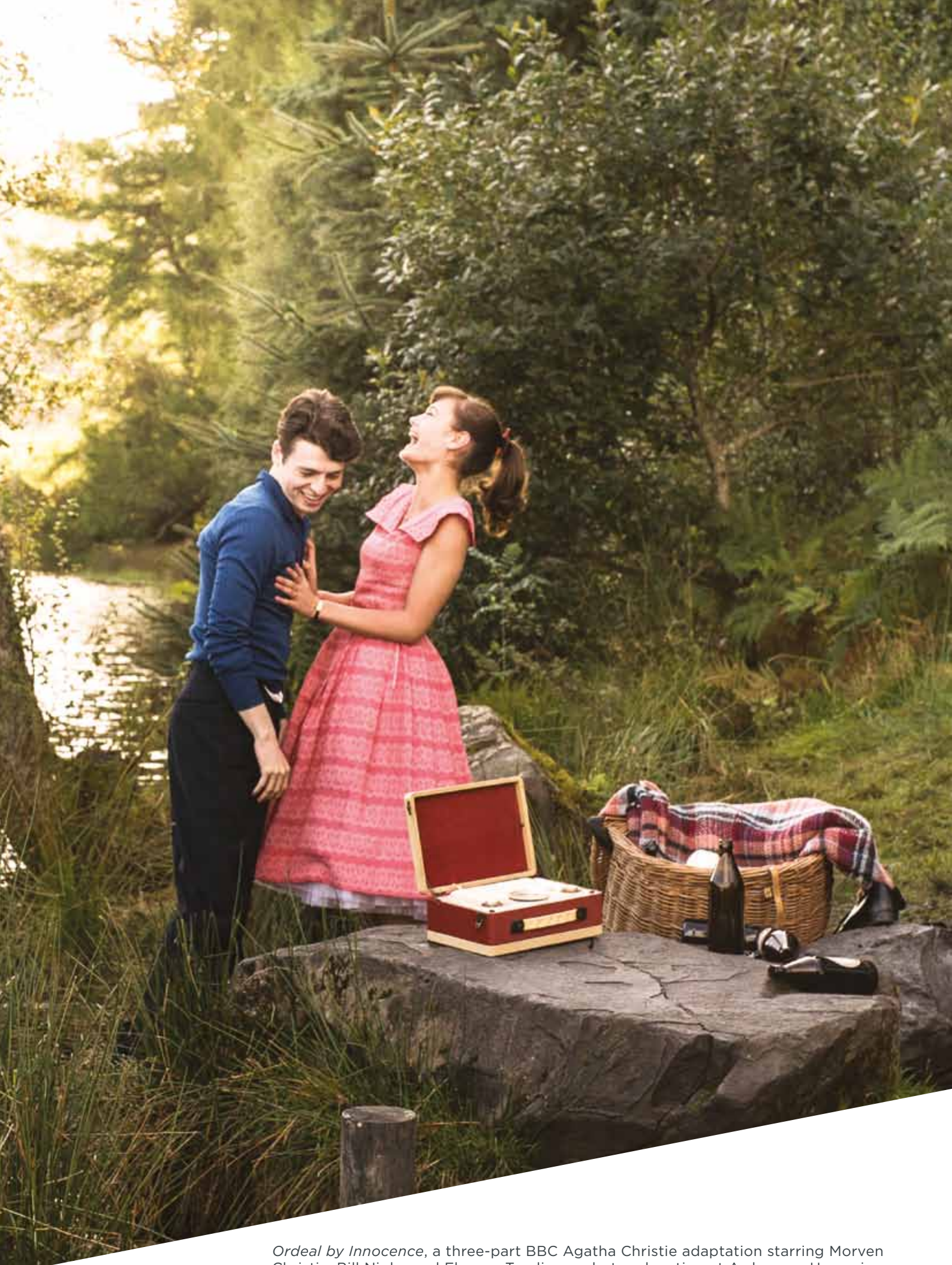
Ordeal by Innocence , a three-part BBC Agatha Christie adaptation starring Morven Christie, Bill Nighy and Eleanor Tomlinson shot on location at Ardgowan House in Inverclyde. The series received production growth funding from Screen Scotland to enable the production to be based in Scotland and to utilise Scottish crew.