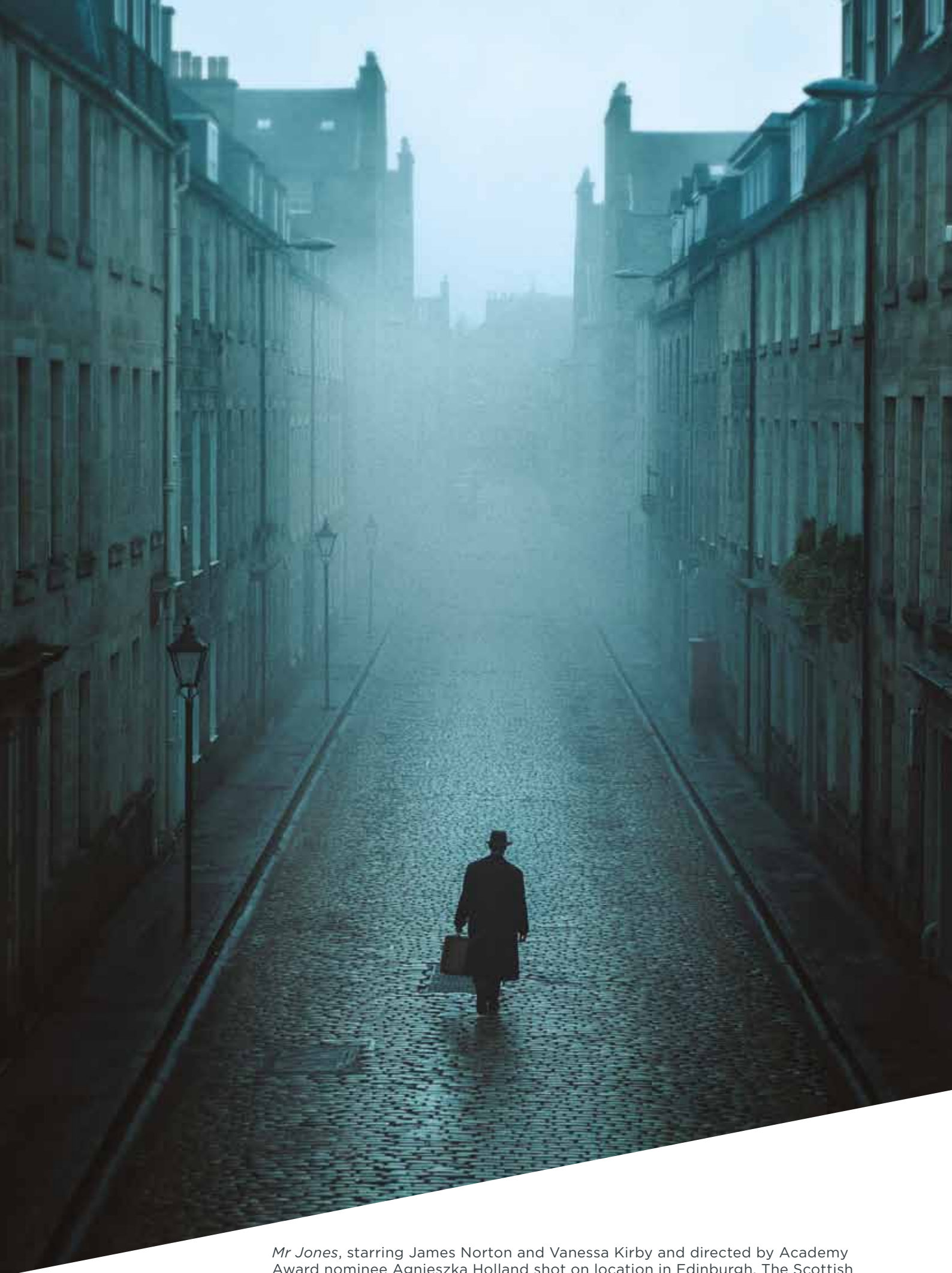
Mr Jones , starring James Norton and Vanessa Kirby and directed by Academy Award nominee Agnieszka Holland shot on location in Edinburgh. The Scottish co-producer accessed Screen Scotland funding to attract this high-profile international project to Scotland.