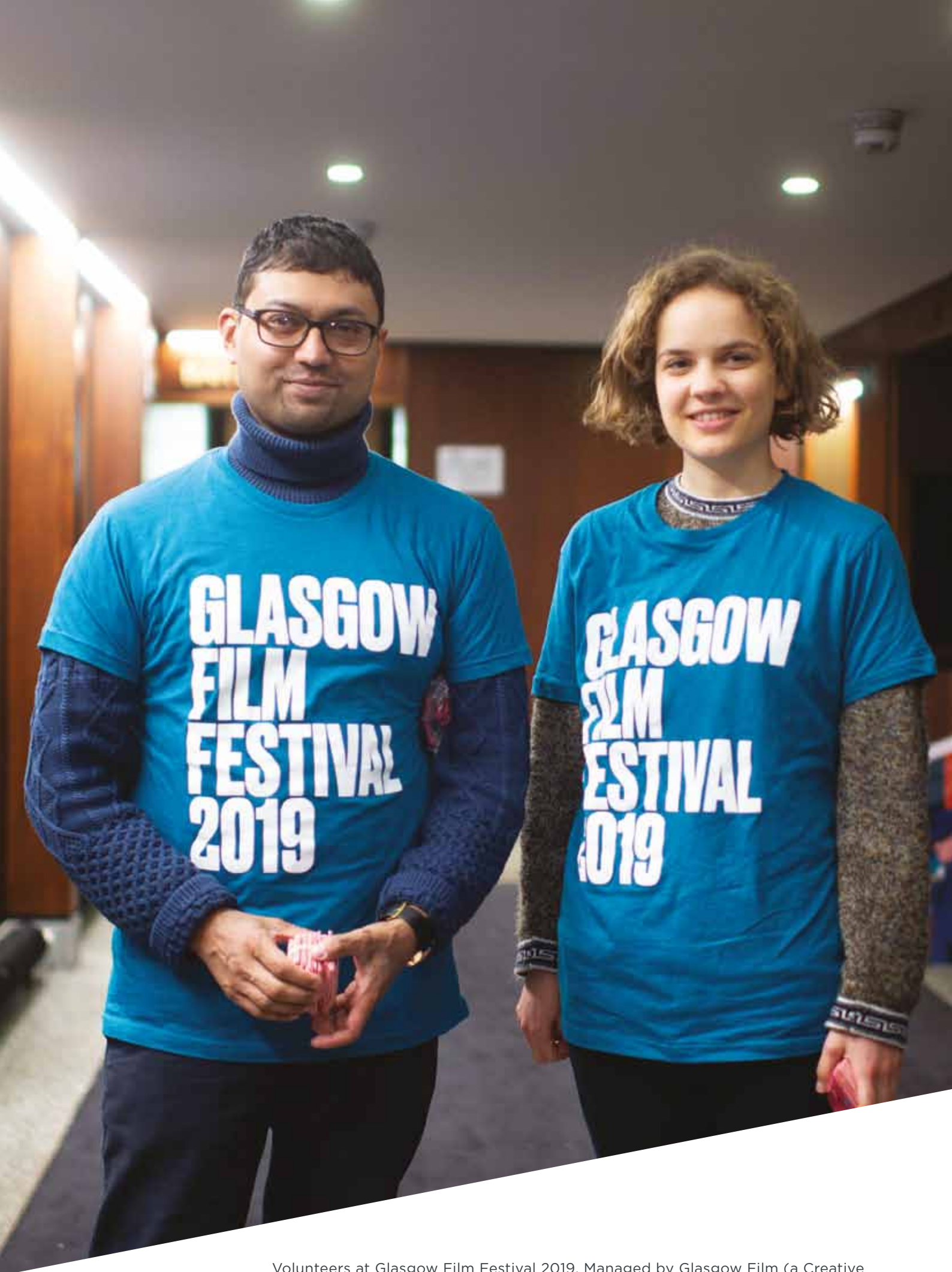
Volunteers at Glasgow Film Festival 2019. Managed by Glasgow Film (a Creative Scotland Regularly Funded Organisation), the 2019 festival enjoyed record ticket sales and featured a strong programme of Scottish and international talent.