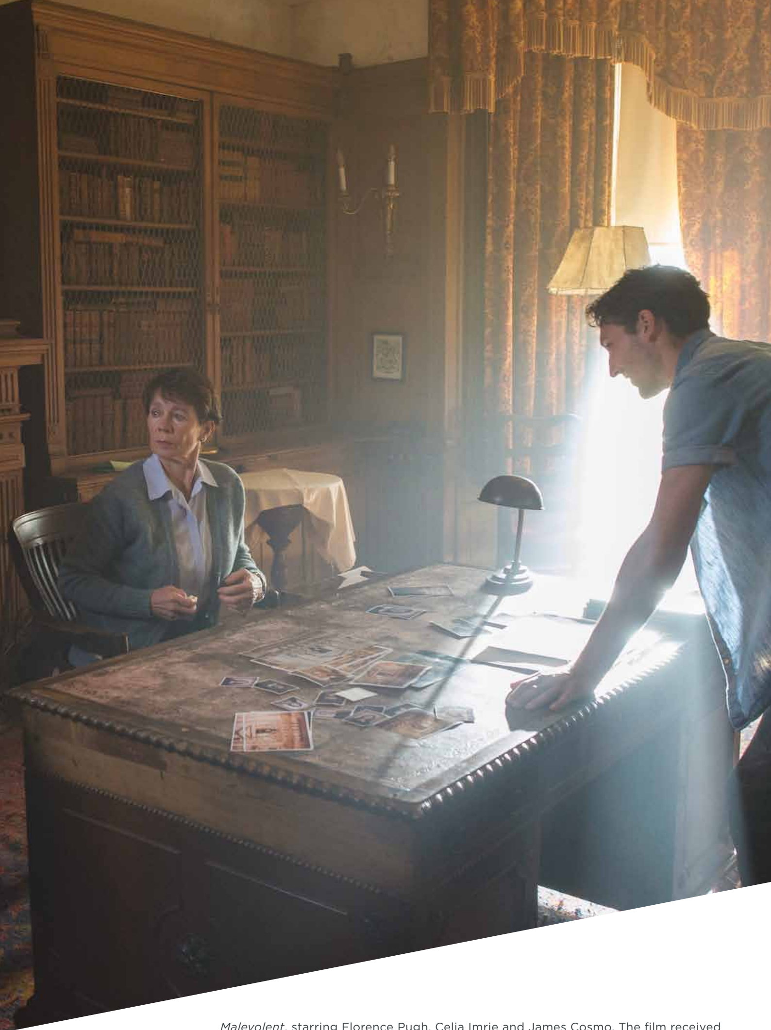
Malevolent , starring Florence Pugh, Celia Imrie and James Cosmo. The film received production funding and production growth funding, which enabled the project to shoot entirely on location in Scotland.