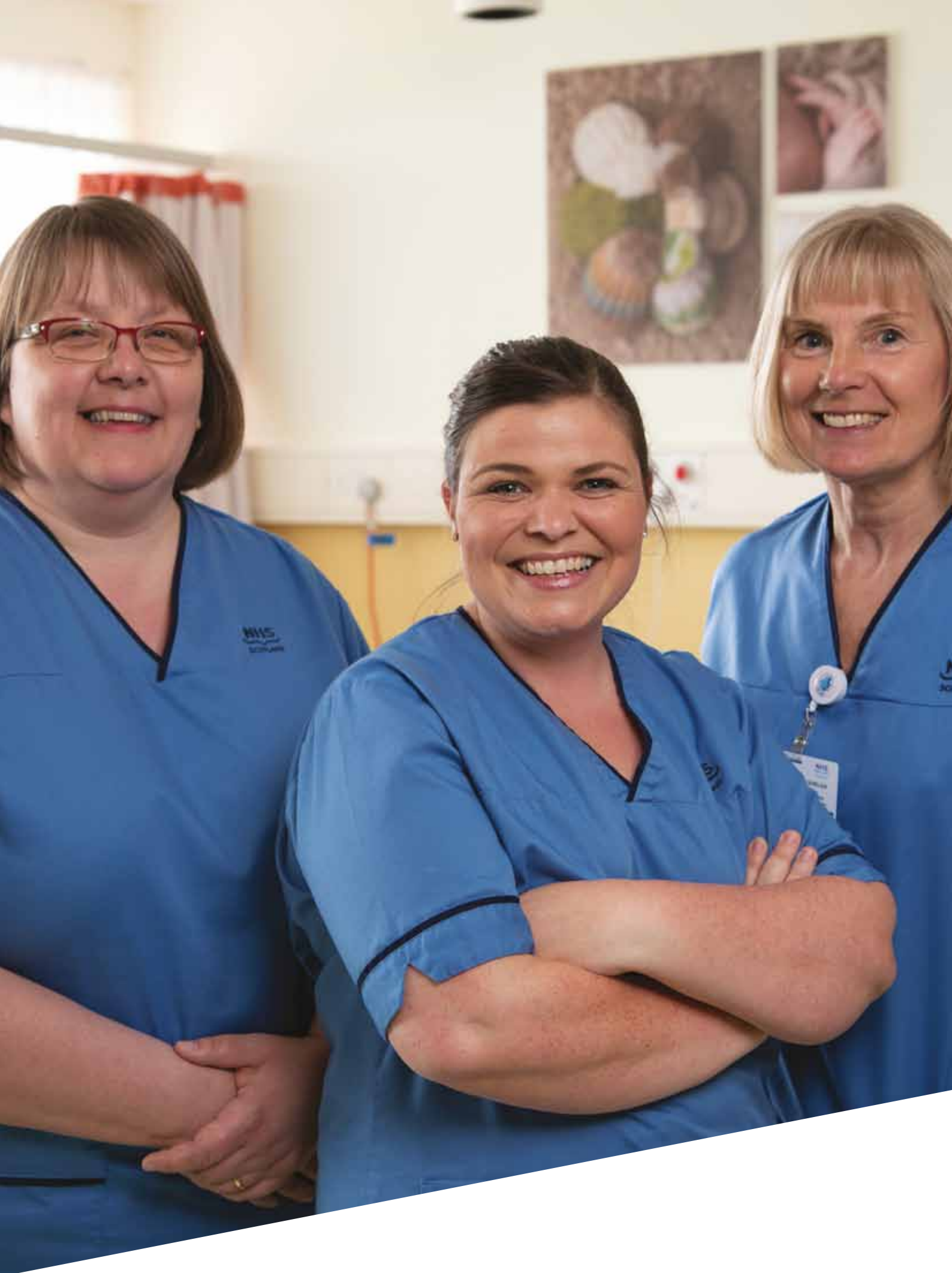
The Highland Midwife made by Glasgow-based Matchlight, who recently received a slate development award through Screen Scotland's new £3m Broadcast Content Fund.